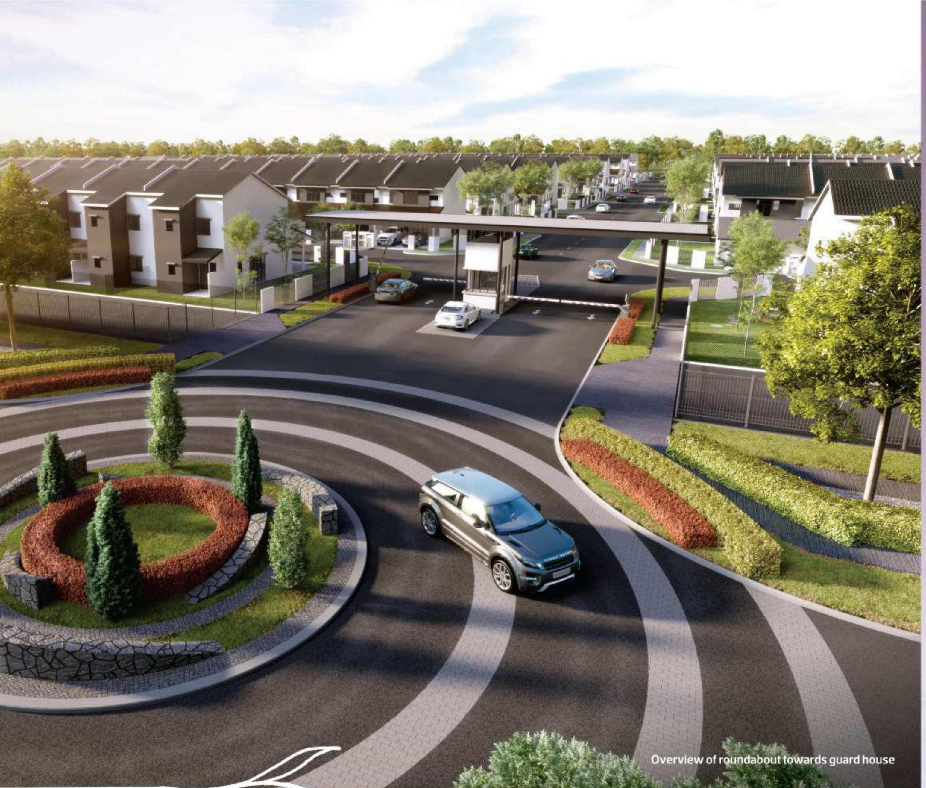
Overview of roundabout towards guard house