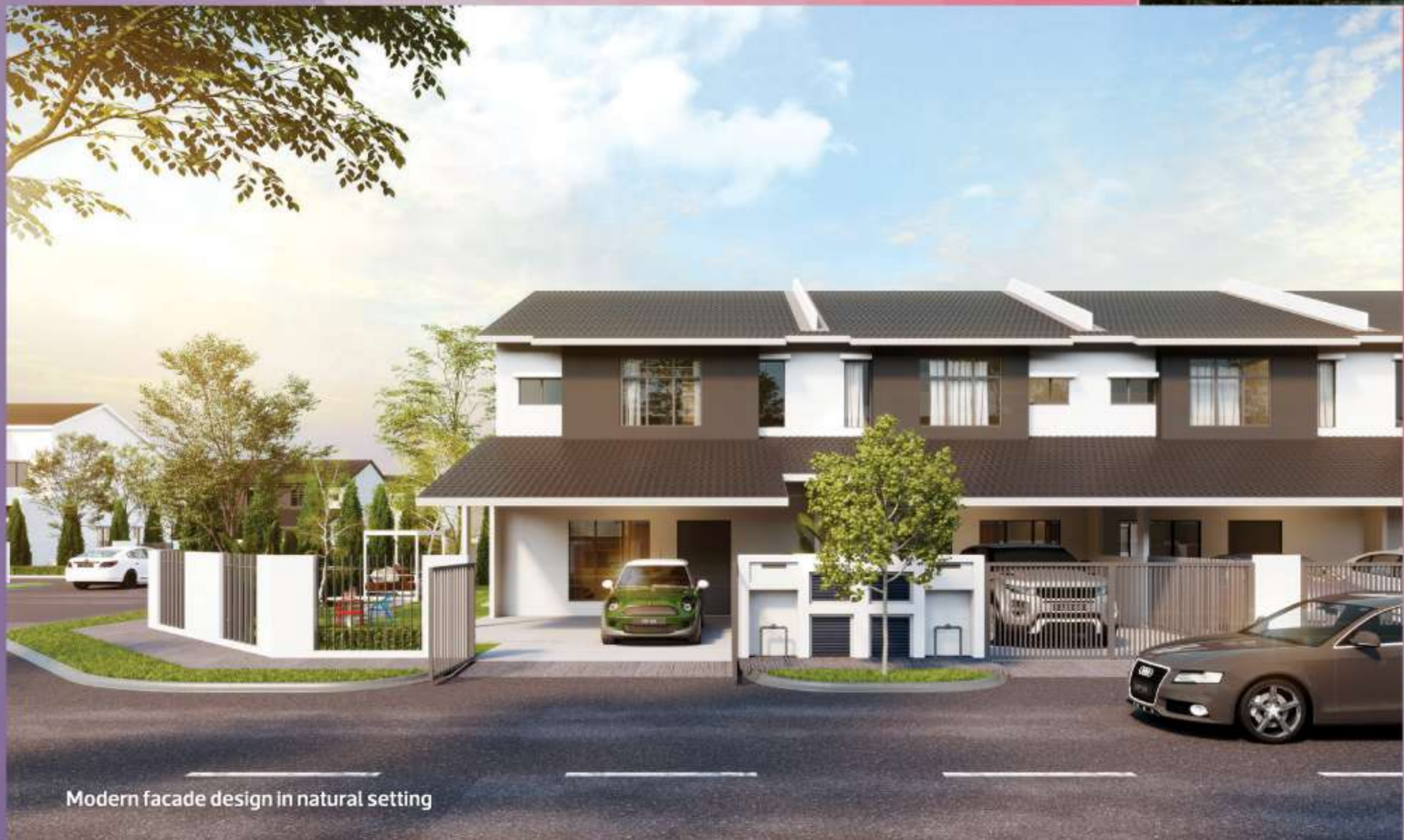
Modern facade design in natural setting